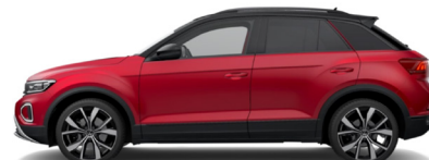
Kings Red Metallic Black Roof