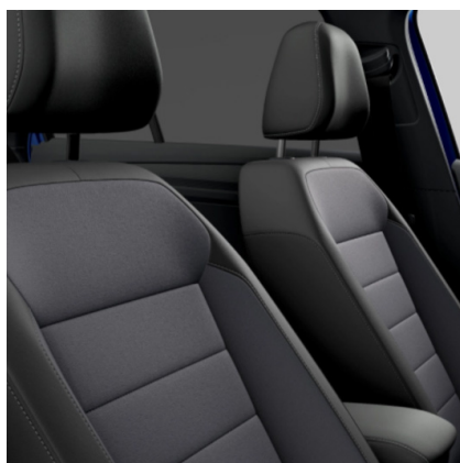
"Vienna" leather Platinum Grey/Black (LE) Optional on Style