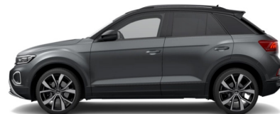
Indium Grey Metallic Black Roof