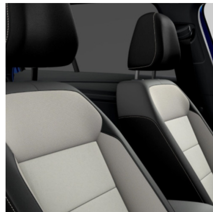
"Deep Iron Grey" ArtVelours cloth Storm Grey (XI) Standard on Style