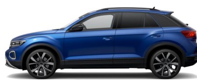
Ravenna Blue Metallic Black Roof