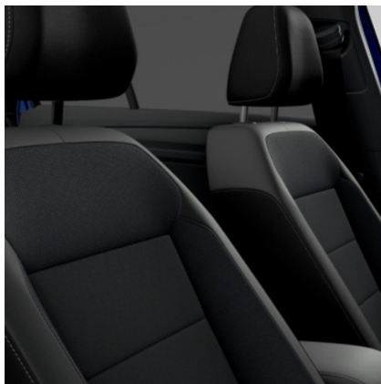
"Deep Iron Grey" ArtVelours cloth Titan Black (FX) Standard on Style Models