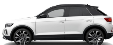
Pure White Solid Black Roof