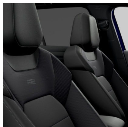
"Nappa Carbon Style" leather Black/Carbon (EM) Optional on R-Line