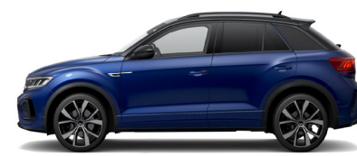
Lapiz Blue Metallic Black Roof