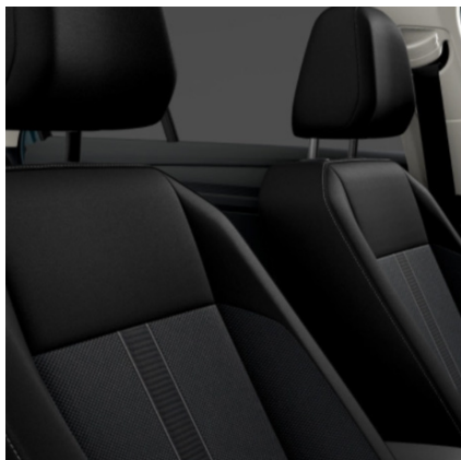
"Pewter Matte" cloth Titan Black/Ceramique (FJ) Standard on Life and Edition 75