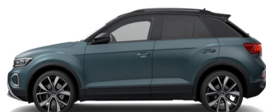
Petroleum Blue Metallic Black Roof