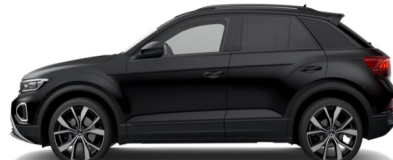
Deep Black Pearl Effect