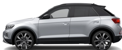
Pyrite Silver Metallic Black Roof