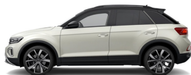
Ascot Grey Solid Black Roof