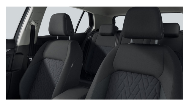
'Nature Cross' cloth Soul Black (BD) Standard on Life and Edition 75