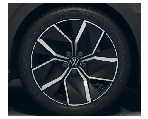
OPTIONAL ON STYLE & R-LINE 18" Leeds Alloy Wheel 7.5J x 18 Tyres: 225/40 R18