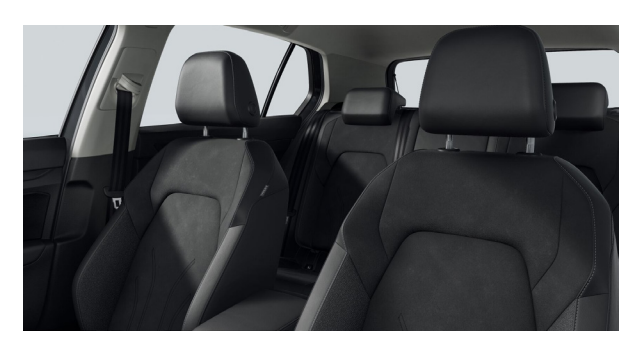
'Brush Dark' cloth Soul Black (BD) Standard on Style