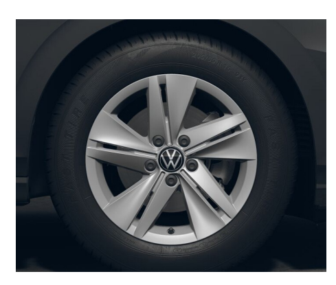
STANDARD ON LIFE 16" Norfolk alloy wheels 7J x 16 Tyres: 205/55 R16

The addition of optional extras may result in the vehicle increasing in Co2 g/km and therefore, attracting a higher rate of VRT than described in this product guide. For your exact configuration value, both Co2 g/km and RRP, please visit volkswagen.ie configurator.