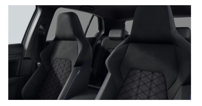
'R-Line' cloth Anthracite (IR) Standard on R-Line models