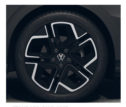
STANDARD ON R-LINE 18" York alloy wheels 7.5J x 18 Tyres: 225/40 R18