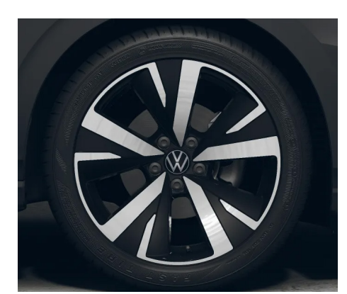
OPTIONAL ON STYLE 18" Catania Alloy Wheel 7.5J x 18 Tyres: 225/40 R18

The addition of optional extras may result in the vehicle increasing in Co2 g/km and therefore, attracting a higher rate of VRT than described in this product guide. For your exact configuration value, both Co2 g/km and RRP, please visit volkswagen.ie configurator.