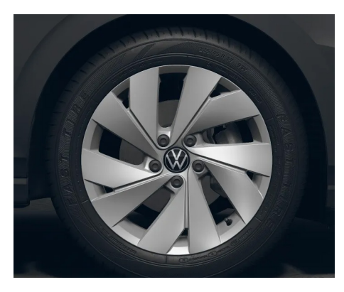
STANDARD ON EDITION 75 & STYLE Optional on Life 17" Nottingham alloy wheels 7.5J x 17 Tyres: 225/45 R17