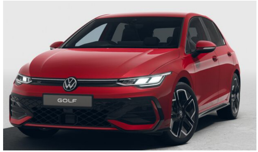
Note: The above image displays colour Kings Red Metallic