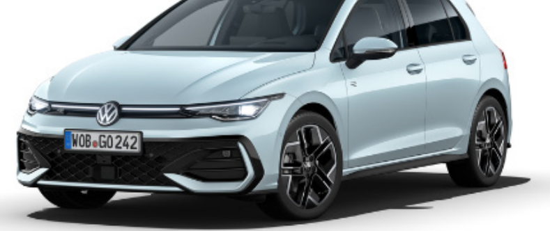
Note: The above image displays colour Ice Blue Metallic

The above specifications are for information purposes only as our products are continually updated and changes may be made to the specifications at any time. If you require any specific feature, you must consult your local dealer who is regularly updated with any change in specification. Specifications are subject to change without notice.