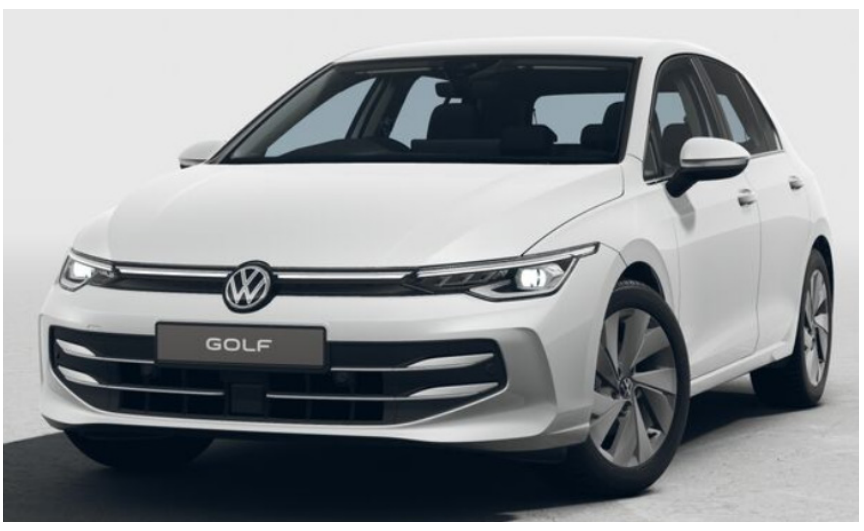
Note: The above image displays colour Oryx White Pearl Effect