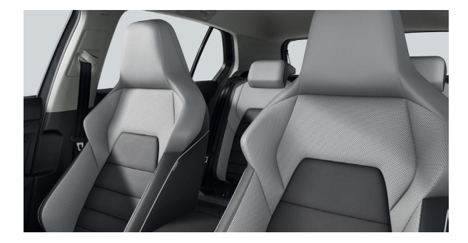
'Vienna' Leather WL3 Pack Soul (BD) Option on Style models Note: Not availabe on mHEV models