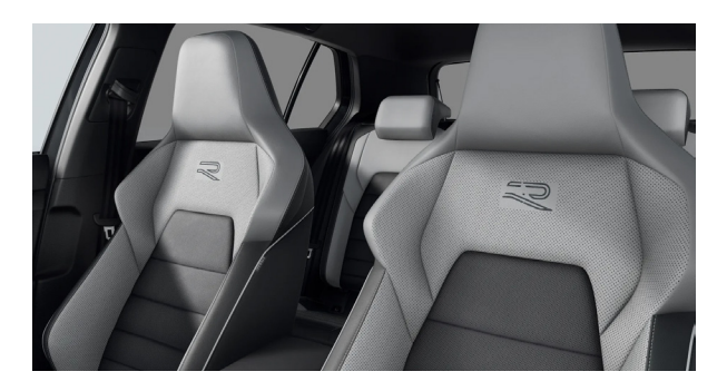
'Vienna' Leather WL9 Pack Anthracite (IR) Option on R-Line models Note: Not availabe on mHEV models

* Optional at extra cost. Please note, the print processes do not allow exact reproduction of the upholstery colours.