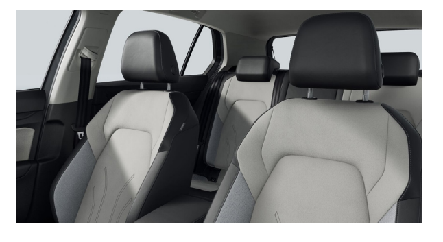
'Mistral' cloth Storm Grey (CR) Optional on Style models