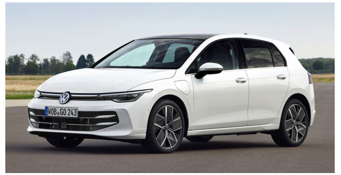
Note: The above image displays the optional 18" Leeds Alloy Wheel